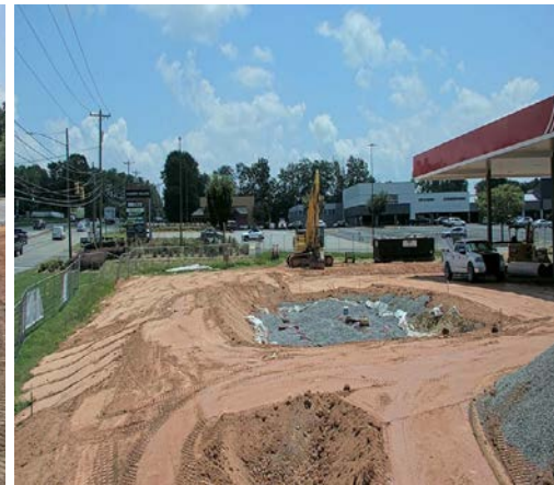
Outparcel 2 - Murphy Oil Projected to open October 2025