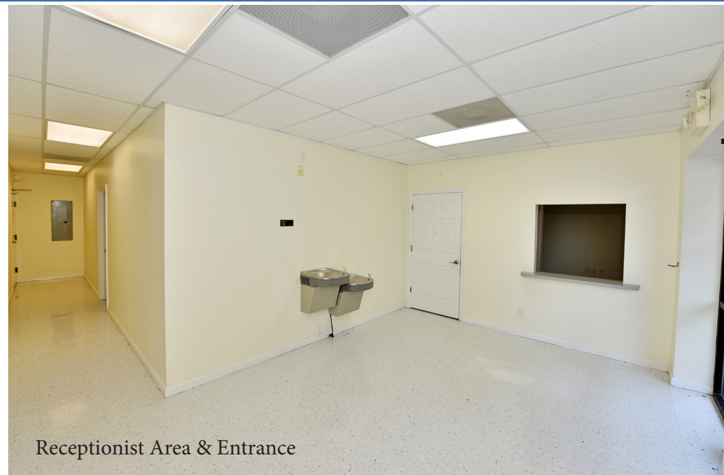
Receptionist Area & Entrance