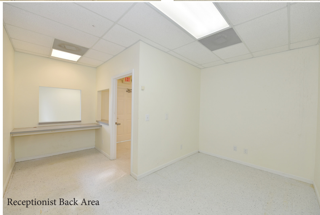
Receptionist Back Area