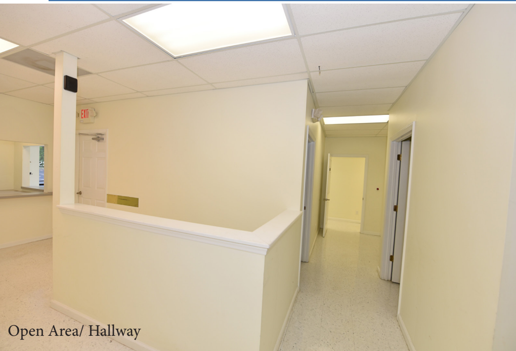
Open Area/ Hallway