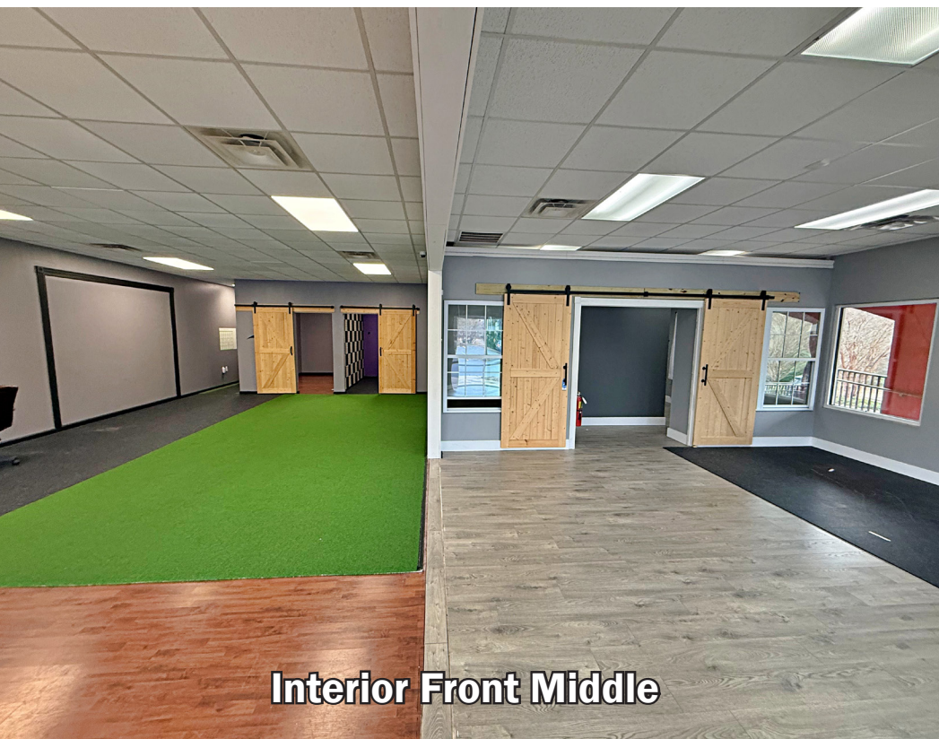
Interior Front Middle