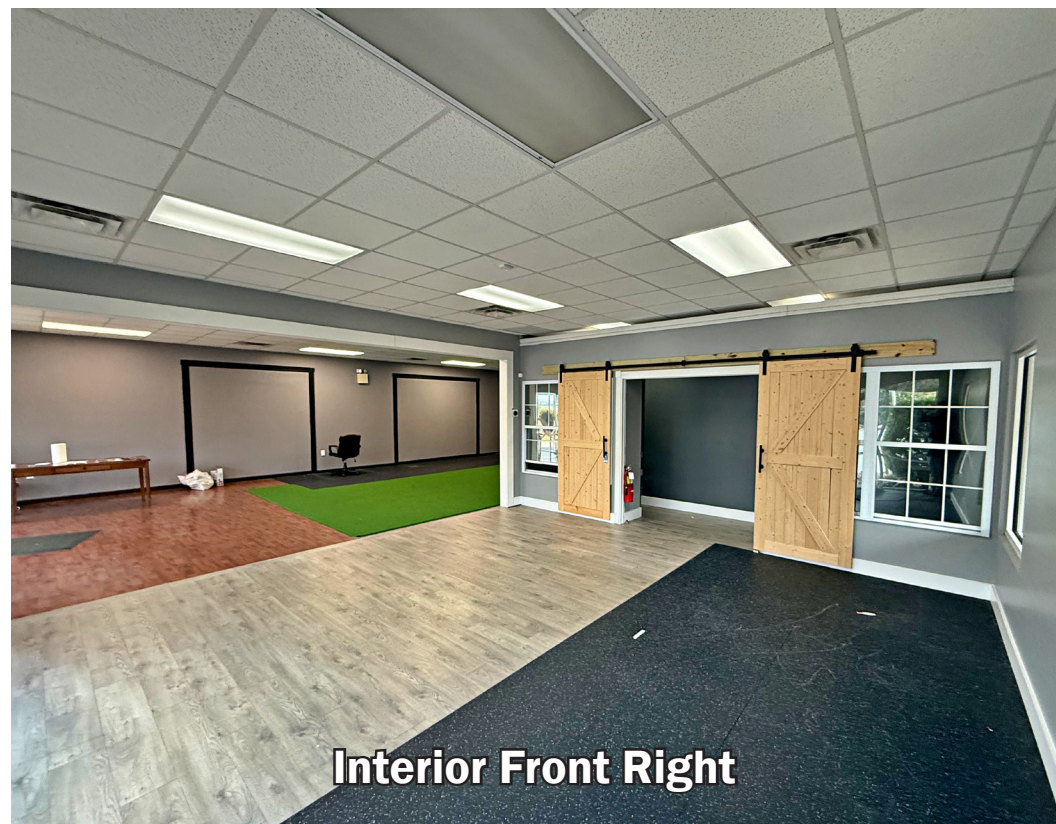
Interior Front Right